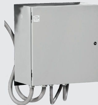
NEMA4 control panel