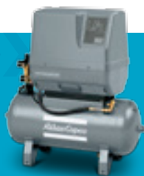
LFx Tank Mounted