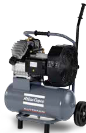
AF 30 E 24

AF series 230 Volt 1 phase - 8 bar(e)/115 psig for AF 20 E or 10 bar(e)/145 psig for AF 30 E