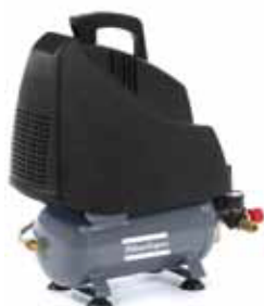
AH 15 E 6