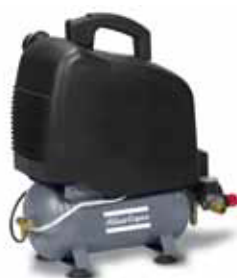
AH 10 E 6