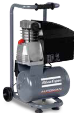
AF 20 E 10