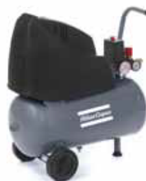
AH 15 E 24