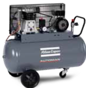
AC 20 E 90 H