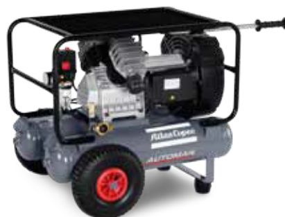
AF 30 E 22