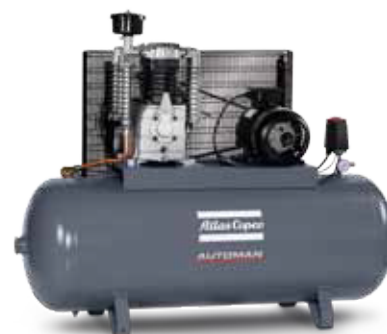
AC 55 E 270 H