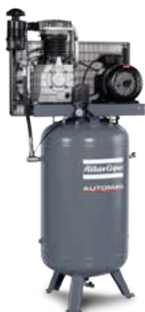
AC 75 E 300 V