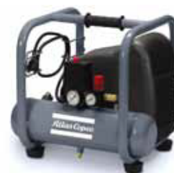
AH 20 E 6