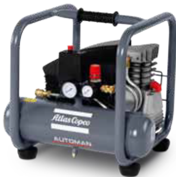
AF 20 E 6