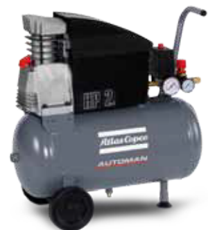
AF 20 E 24